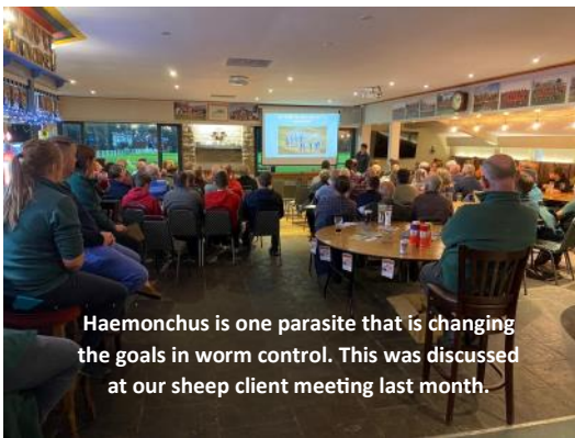
Haemonchus is one parasite that is changing the goals in worm control. This was discussed at our sheep client meeting last month.

We have long preached that adult ewes have good immunity to worms, and treatment should only really be a consideration around lambing when this immunity can be weakened by the demands of pregnancy and lactation. Even then, good nutrition goes a long way towards avoiding this. However, a worm called Haemonchus contortus is becoming an increasing problem as seasons become warmer and wetter. It was classically a problem of southern counties of England but this year, weather patterns have been perfect for its survival and we have seen cases across the practice. Adult sheep as well as lambs are affected as they have poor immunity and we have seen illthrift, very sick sheep and some deaths. However, many farms remain unaffected. Worryingly, Haemonchus develops resistance to our wormer drugs very quickly, so over-treating in the short term means we will have reducing treatment options in the long term. We cannot give a simple answer on this one and our advice will change for each farm and each season.